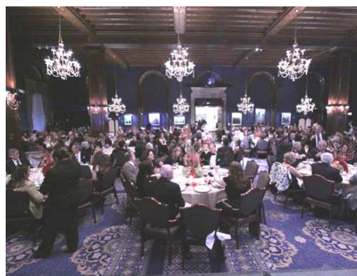
Gala Dinner 2009 Union League Club of Chicago